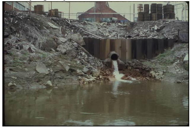
Industrial waste discharged to Cuyahoga River, Ohio, 1973

• EPA also helps keep our beaches clean. In FY2018 EPA awarded more than $9 million in grants to help states monitor recreational beaches for pollution and to support programs that alert the public when high bacteria levels put beachgoers at risk for gastrointestinal illness, eye, ear and nose infections, skin rashes and infections, and worse.