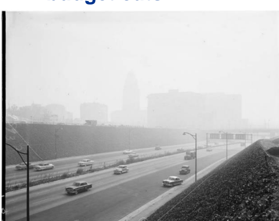
A hazy Los Angeles in December 1948 before the EPA was established and the Clean Air Act